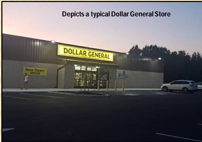
Depicts a typical Dollar General Store